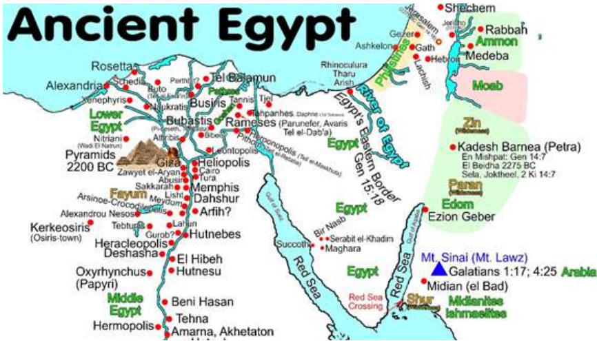
Figure 1: Ancient Egypt 2

The 'river of Egypt' is not the Nile, but is traditionally understood to be the Wadi El Arish river valley east of the Nile, terminating at Arish on the Mediterranean Sea (See Figure 1). A google earth examination clearly shows the dried-up river course.