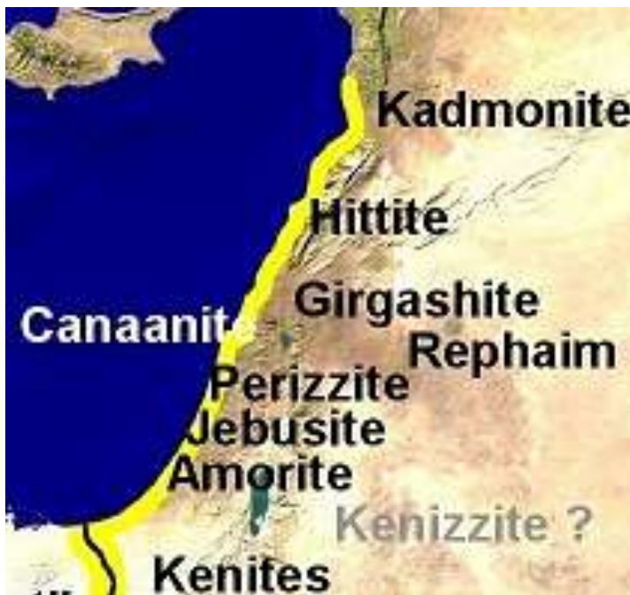
Figure 3: Location of Tribal Land promised to Abraham in Gen 15:18 ~ 21 6