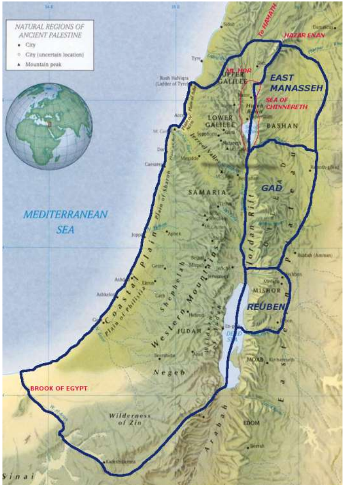
Figure 4: Borders of Israel 9

23 adds some details to the borders of the tribes on the East of the Jordan. Using this information and the natural defensive features of mountains and rivers, the borders of Israel are estimated as shown in Figure 4.